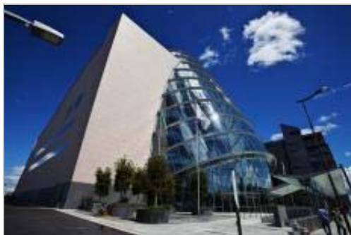
Convention Centre Dublin (CCD)

PSI and PSNI registered pharmacists can attend for €250 on one of the main congress days, Monday 2 nd to Thursday 5 th September .